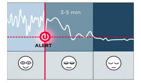
Fig. 1. The function of the device (Van Elslande et al, 2013)

to tiredness. So anti-fatigue alarm technology is needed to inform drivers before they fall asleep at the wheel or before they lose their consciousness in their vehicles and on the roads. This device has warning signals in two dangerous situations: when drowsing off or when there's a reduction of reaction. The anti-fatigue alarm takes 3–5 minutes to measure a driver's present brain activity and then their tiredness is approximated from this level. Drivers can put it on before they drive and it doesn't need to drive a particular number of miles. The anti-fatigue alarm controls the level of driver's reaction and it is even helpful for short distances. The anti-fatigue alarm has been studied and examined as to whether it decreases the risk of accidents by the National Scientific Research Centre (CNRS) in France. The results of this study have proved the success of the device in warning at two levels in commencing signs of drowsiness and reduction of reaction (Van Elslande et al, 2013).